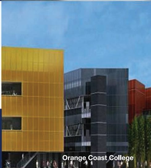
Orange Coast College

Construction of a new 90,000 square-foot multi-discipline instructional complex consisting of lecture space, faculty offices, and computer labs. This is Phase I of a two-phase project. Phase I is the Math, Business, and Computing Center. Phase II is the Social Science and Literature and Languages building.