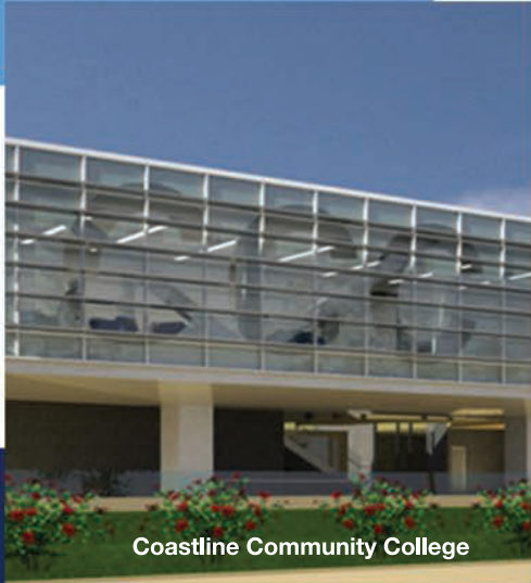
Coastline Community College

Addition of a 2,000 square-foot Student Resources Center to provide a student-oriented space promoting student success and extended learning opportunity. This project also includes the addition of an entry plaza, seating and student café.