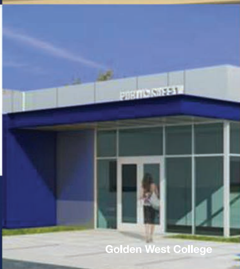
Golden West College

Construction of a new 6,000 square-foot Campus Safety/Community Education/Swap Meet facility, located on the SW corner of the main campus facing Golden West and Edinger parking lots. The project will remove existing campus safety structure and adjust drive aisles and pedestrian access to campus.