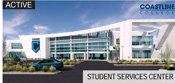
STUDENT SERVICES CENTER