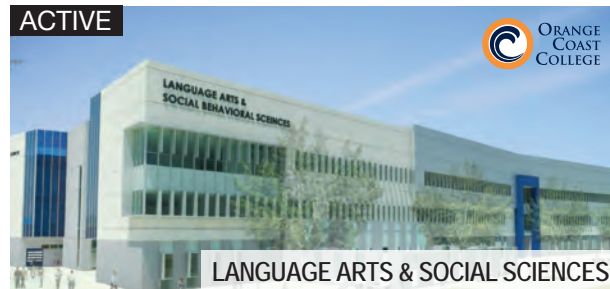
LANGUAGE ARTS & SOCIAL SCIENCES