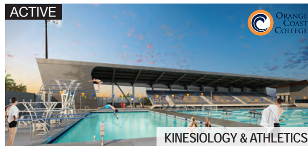
KINESIOLOGY & ATHLETICS