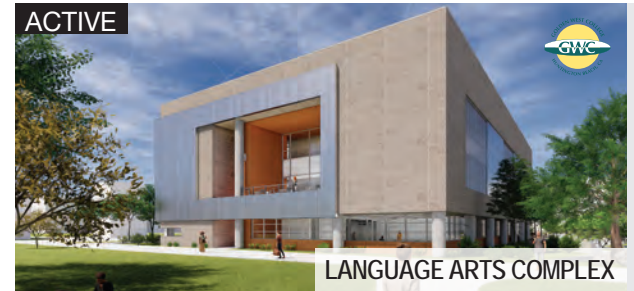
LANGUAGE ARTS COMPLEX