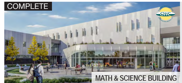
MATH & SCIENCE BUILDING