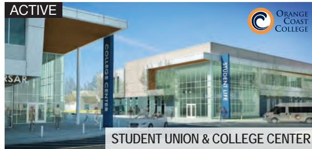
STUDENT UNION & COLLEGE CENTER