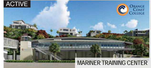
MARINER TRAINING CENTER