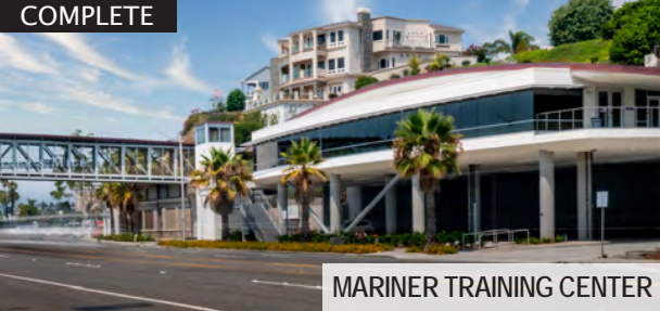
MARINER TRAINING CENTER