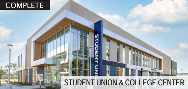
STUDENT UNION & COLLEGE CENTER