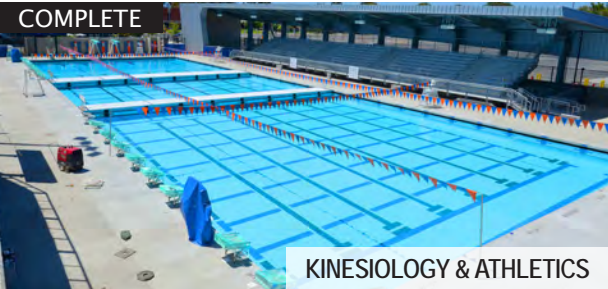
KINESIOLOGY & ATHLETICS