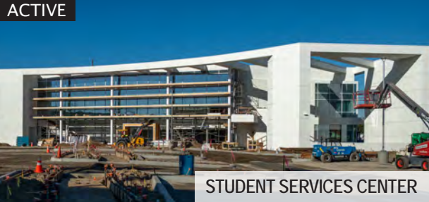
STUDENT SERVICES CENTER