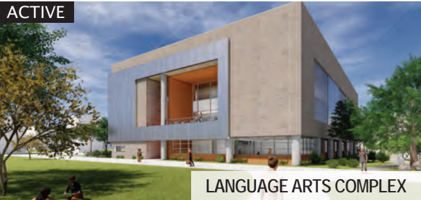
LANGUAGE ARTS COMPLEX